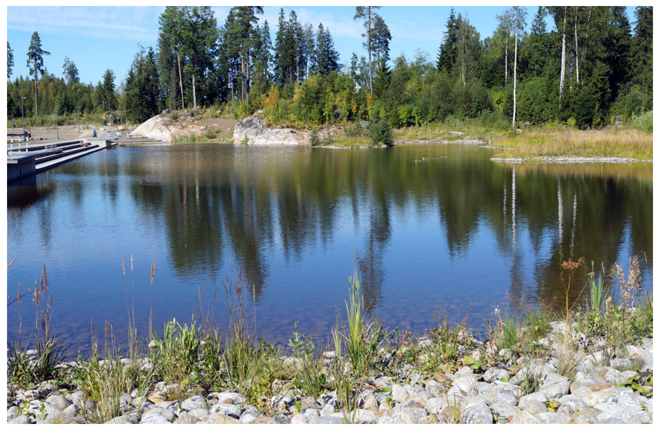
In Vuores suburb in Tampere, controlling rain water is thoroughly planned. This park is a recreational area, but it will also help in controlling rain waters.

In future city pavements, the gaps in brick paving are well optimized. Streets have to be comfortable