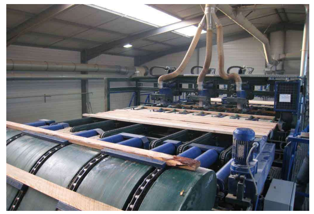
Figure 1. Wood industrial facility hall. [12]

In the areas intended for long-term stay, the optimum conditions of thermal-hygrometry microclimate are to be secured during the warm as well as the cold season of the year. The structural design of the