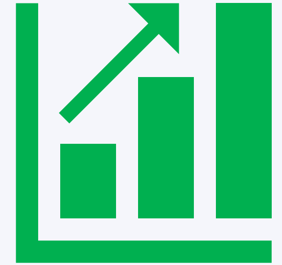
Safe and reliable