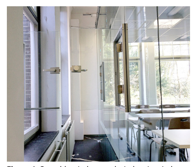
Figure 4. Operable windows and window-in-window construction in the facade.