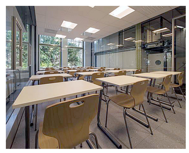
Figure 5. Class room set-up in Experience room.