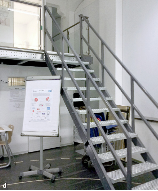
Figure 1. a+b) Experience room, c) test chambers and d) stairs to first level.