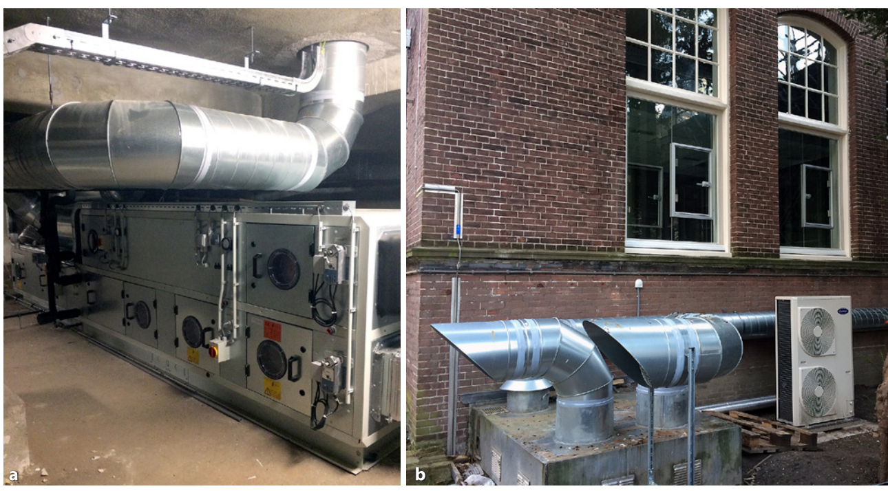
Figure 2. a) Installations in basement and b) cooling unit outside the SenseLab.