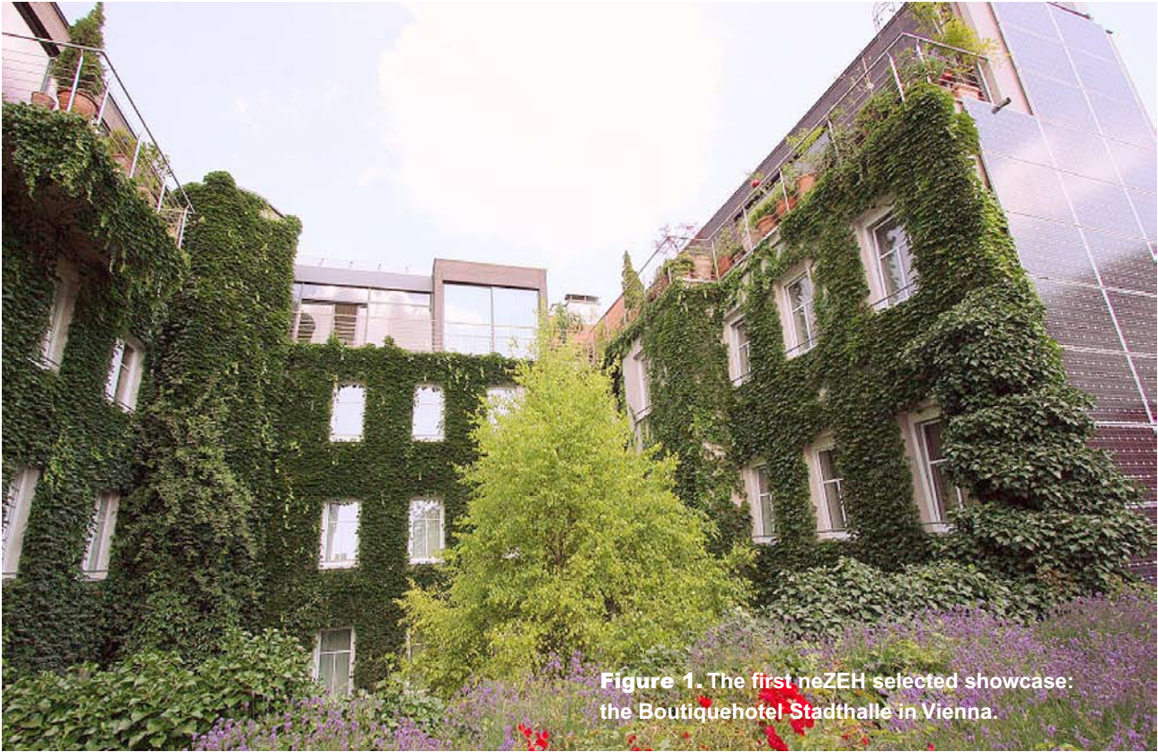
Figure 1. The first neZEH selected showcase: the Boutiquehotel Stadthalle in Vienna.