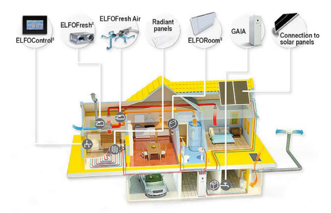
Components for Clivet's ELFOSystem GAIA for "Class A" single family houses.

This approach of Year Round Complete Comfort Systems, involves a new mind set in which Comfort Systems are a single entity in which all the elements are composed by products specifically designed to interact with each other, influencing the highest level of energy efficiency in generation, distribution, emission and control. These results cannot be reached by simply assembling individual products, because, even if we are using the best individual products available on the market, their interaction cannot guarantee the same level of efficiency of a complete system where all the elements have been designed since the beginning to work and interact together.