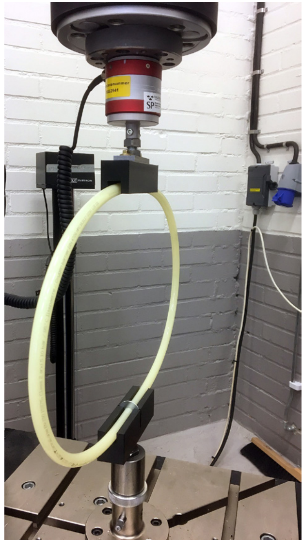
Figure 1. Tensile testing machine used by RISE to measure PEX flexibility.

A total of nine mechanical tests were employed by RISE and their data analysed by the authors of this article. For the purposes of comparison and presentation, a three-star league table for each mechanical test was devised. In this way, high achievers would be recognized in true Olympic fashion and low achievers would be singled out for their poor performance (see Figure 2a ). An identical assessment approach was adopted for hygiene testing (see Figure 2b ).