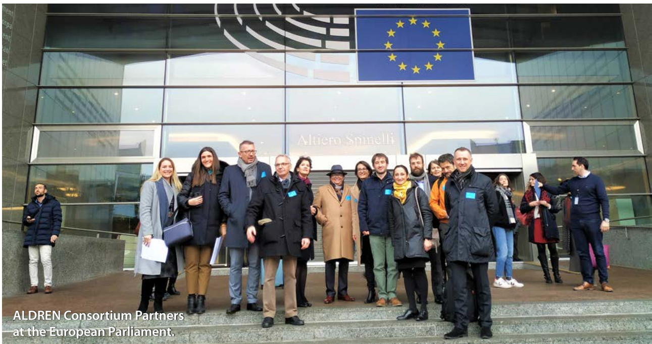
ALDREN Consortium Partners at the European Parliament.