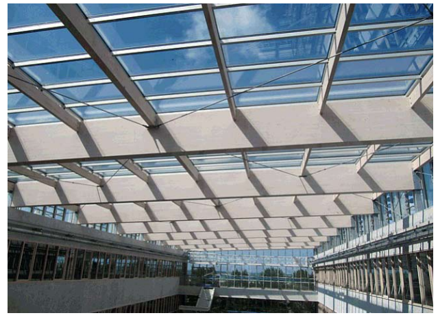
Figure 2. Roof and area of the atrium.