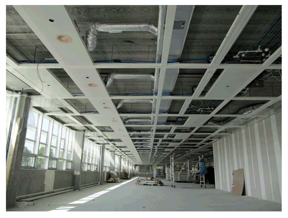
Figure 4. Ceiling of concrete core activation for heating and cooling, with integrated air diffusers in the ceiling panels..

Based on the design and the actual relalisation the Milieu Index Gebouw has been calculated for the TNT Green office [DGMR 2008], the building will have an Environmental Index of at least 1,000 points in accordance with the GreenCalc methodology. This is more than 1.5 times better than the current building with the highest Building Environmental Index [Volker Wessels 2011]. This index is determined on the basis of the materials and the quantities used. During the design and preparation for the construction of the building continuous attention is devoted to assessing whether the choice of materials is the most environmentally friendly and